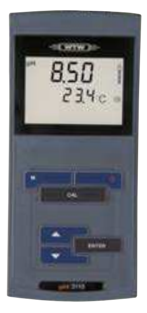
ProfiLine pH 3110