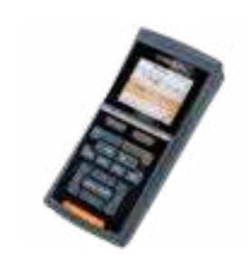
MultiLine® Multi 3630 IDS

Three galvanically isolated measurement channels, can be freely combined for the same or different parameters. Simultaneous multi measurement without compromises.