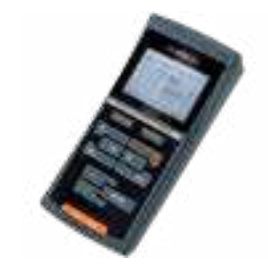
MultiLine® Multi 3510 IDS

The single-channel multi-parameter instrument Multi 3510 IDS is ideal for portable pH measurement in all conditions both outdoors and in a plant. Like all MultiLine® IDS meters, it is also suitable for pH measurement with cable lengths of up to 100 m.