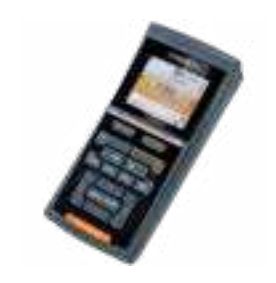
MultiLine® Multi 3620 IDS

Two galvanically isolated measurement channels, can be used simultaneously for identical or different parameters. Economic multi-parameter meter for many applications in which two parameters must be measured and/or stored simultaneously.