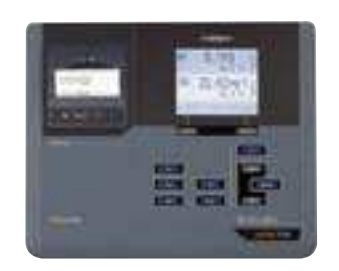
inoLab® pH/ION 7320P (with built-in printer)