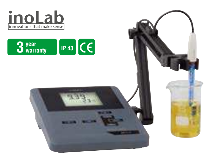
inoLab® pH 7110 SET 4

All benchtop meters are available in applicationoriented sets including sensors and accessories.