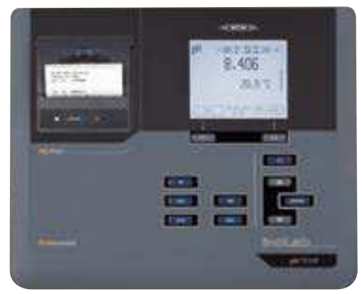
inoLab® pH 7310P (with built-in printer)