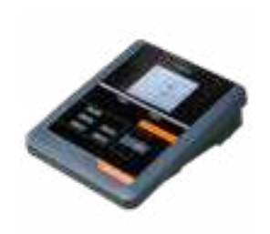
inoLab® Multi 9310 IDS